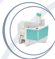
New generation Multichannel Type Pump Head