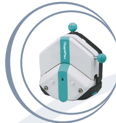
New generation Easy Load Type Pump Head